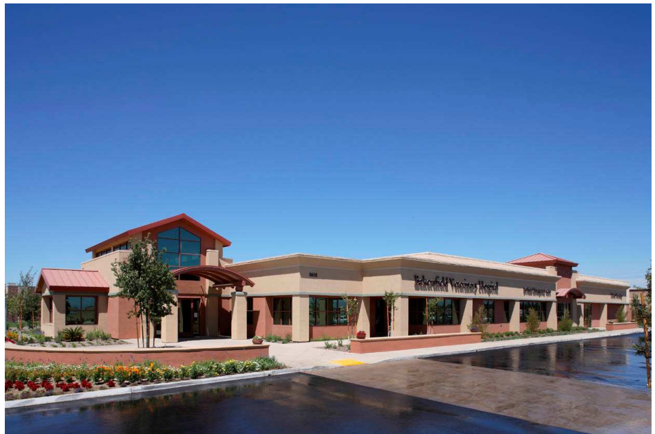
Bakersfield Veterinary Hospital, Bakersfield, CA